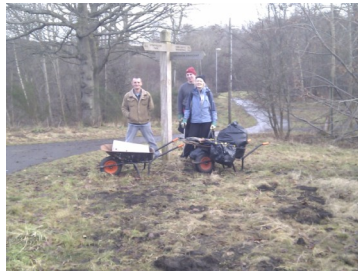
Daffodil and tulip bulbs planted in Forgewood.

Unfortunately, our volunteers are coming across scenes like this too often. The heat from this fire was so much that the material became embedded in the tarmac!! If you see people burning wheelie bins or stripping wire for copper on the Greenlink Cycle Route please report it to Motherwell Police station on 016984 83000 or Northline on 01698 403110 immediately.