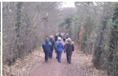
The "Mini BIG Walk" in January let our walkers take in the scenery around town.

Our Paths For All Health Walks run once a fortnight. They start from several locations in Motherwell such as Orbiston, Muirhouse, Forgewood and North Motherwell.