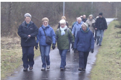
One of our fortnightly Health Walks. All ages and abilities are welcome. Dress for outdoors.