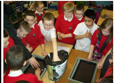
CALDER PRIMARY sowing some seeds in their classroom.

Teasel, Columbine, Oxeye Daisy and Wild Chamomile are just some of the wildflower seeds that have been sowed, so as well as adding to the aesthetic value of the area the children are doing a good bit for improving local bio-diversity.