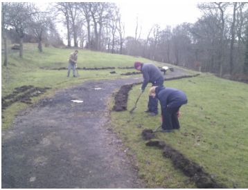
Our volunteers planting bulbs up at Shields Glen